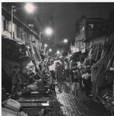
Participants of DBIT, Mumbai doing their Market Research at 4.am in Chor Bazaar (शोर बाजार)