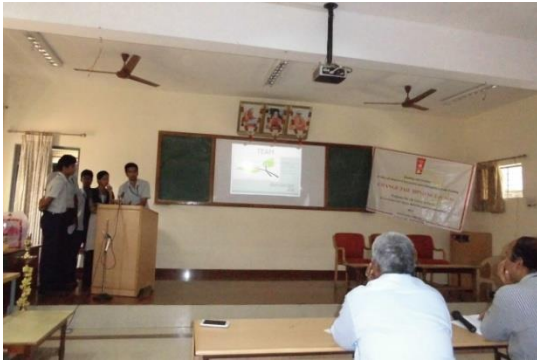
JSS participants during the Business Plan presentation

I Create Rajasthan has started a CMS program at Sanskar School from 3 rd of August.