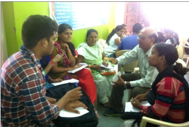
Participants of Snehalaya during the group activity.