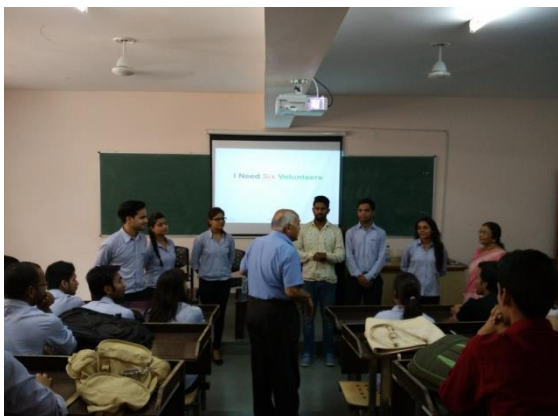
Participants of SGV University