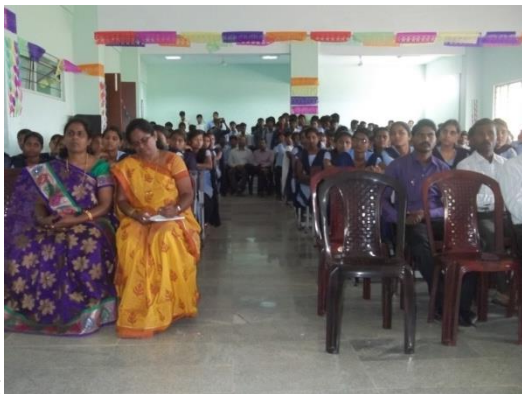
Participants during the opening ceremony at Gadag.