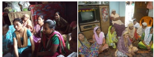
Participants of the Jan Ugahi Trust during the session.