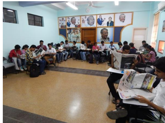
Participants of DBIT doing the Newspaper Exercise.