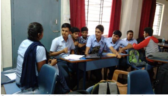
Students of MEI Polytechnic during a discussion.