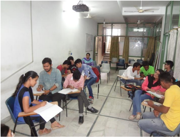
Participants of InFocus during the workshop