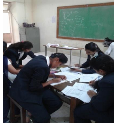
Students of SJP doing their CMS Post test.