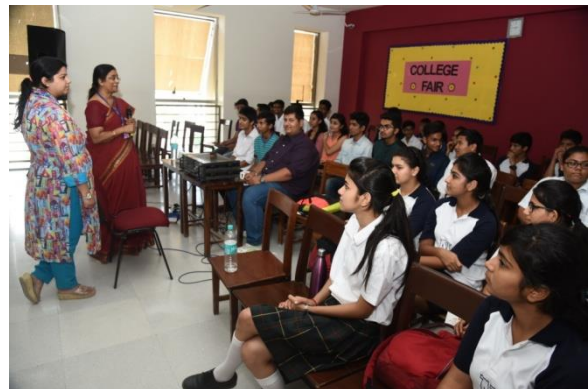
Students at Neerja Modi School during the session