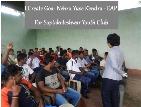
Participants of Yuva Kendra during the session.