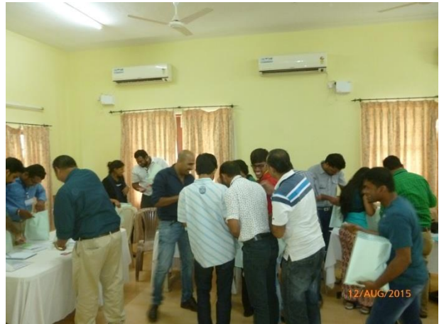
Participants of YMCA during the trade game.